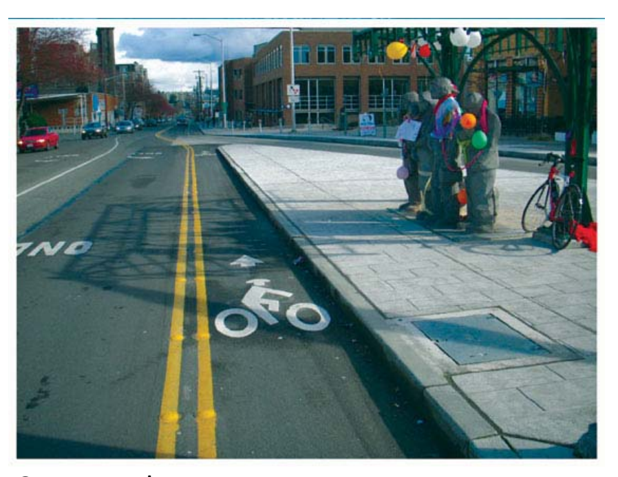
Counter Flow Lane