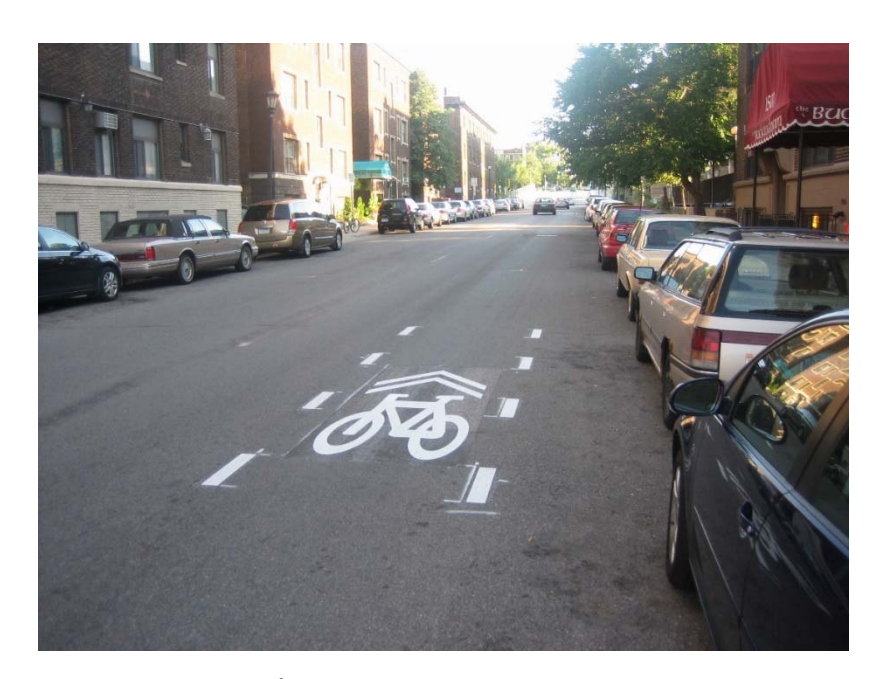
Sharrow w/ Dots