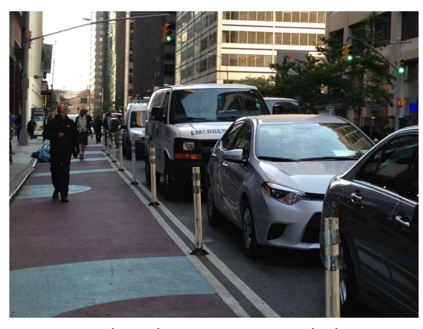
Separated Trail on Existing Asphalt