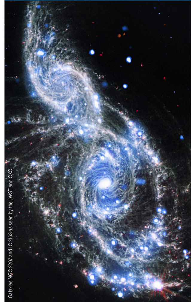
Galaxies NGC 2207 and IC 2163 as seen by the JWST and CXO.

Become a Member Of The Cernan Earth and Space Center!