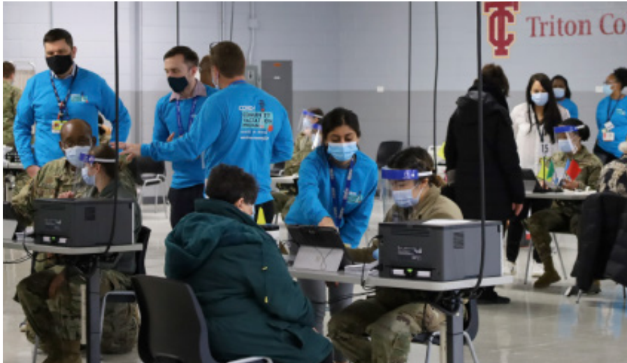
Triton College serves as one of Cook County’s largest vaccination sites.